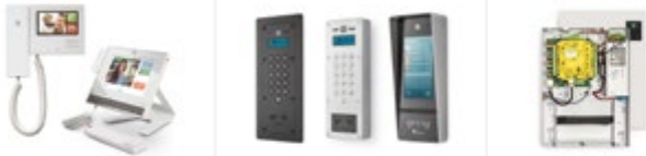
Monitor, Panel and Door Controller